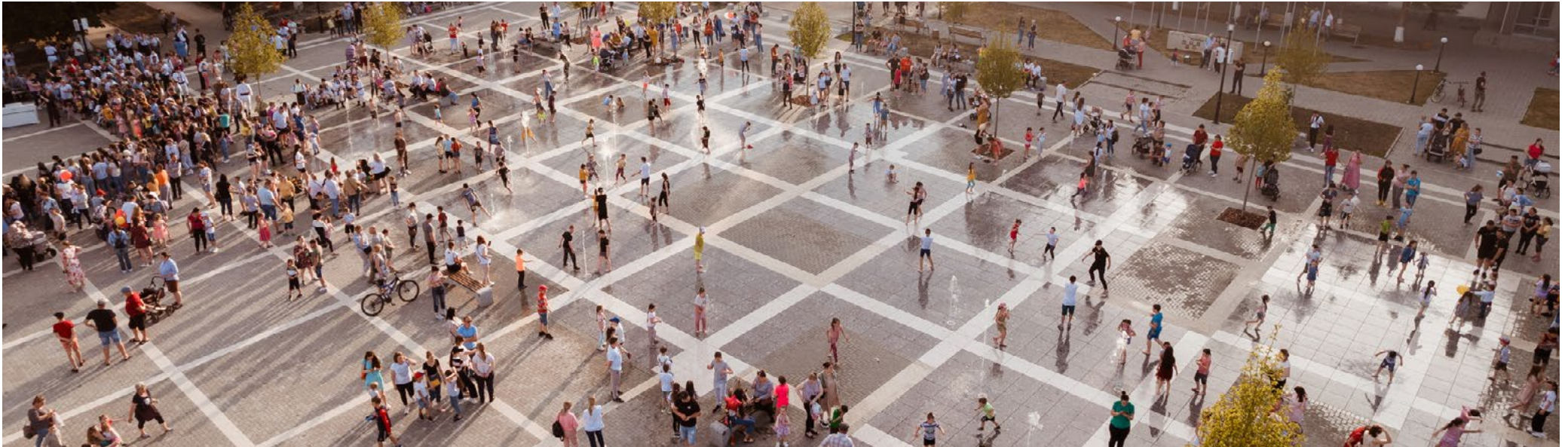
The Independence Square in Ungheni municipality has become pedestrian; street furniture was installed and a dry-type music pavilion with light and music show was built.

The revitalisation of the urban centre increases the attractiveness of Ungheni as a town - a "pillar of growth."