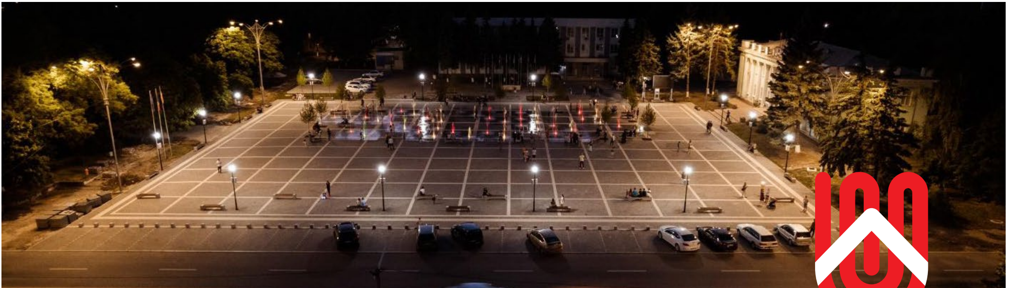
Independence Square in Ungheni during the night.