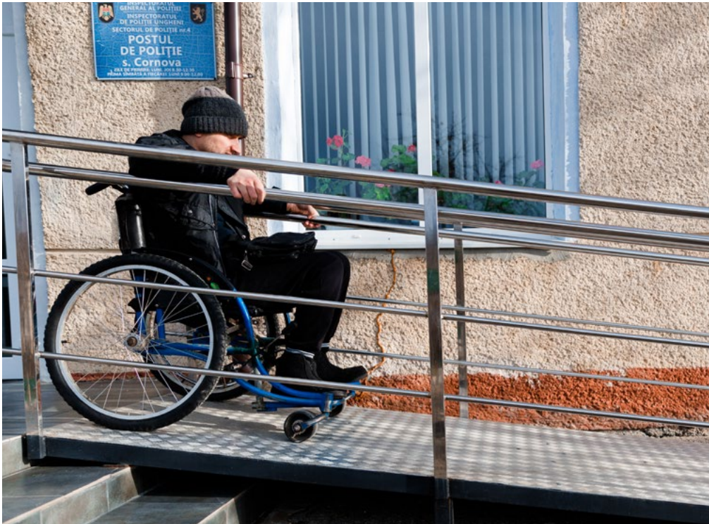
Access ramp installed at Cornova Mayoralty building, Cula sub-region, Ungheni district.